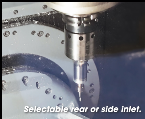
Selectable rear or side inlet.