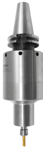
660 Series 50,000 RPM Power to 0.94 HP (0.7 kW)

With patented governed high speed and torque Air Turbine Spindles®, your Hurco VM/VMX machine is a high speed machine!