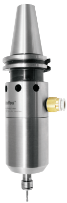
625(X) Series 30,000 - 65,000 RPM Power to 0.76 HP (0.57 kW)

Now Your Hurco VM/VMX CNC Delivers Faster Production 24/7