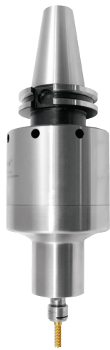
650(X) Series 25,000 - 40,000 RPM Power to 1.4 HP (1.03 kW)