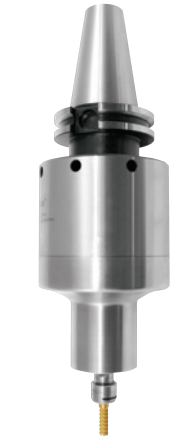
650(X)CAT40 0.80 - 1.40 hp