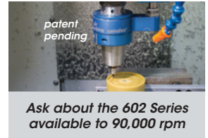
Ask about the 602 Series available to 90,000 rpm

Automatically load Air Turbine Spindles® with our wrap around Toolchanger Mounting Assembly.