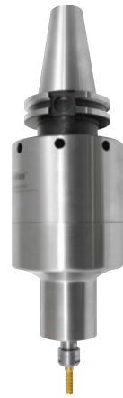
NEW - 660 Series 50,000 rpm Power to 1.60 hp Quadruple ceramic bearings standard

With patented governed high speed and torque Air Turbine Spindles®, your DMG MORI Machine is a high speed machine!